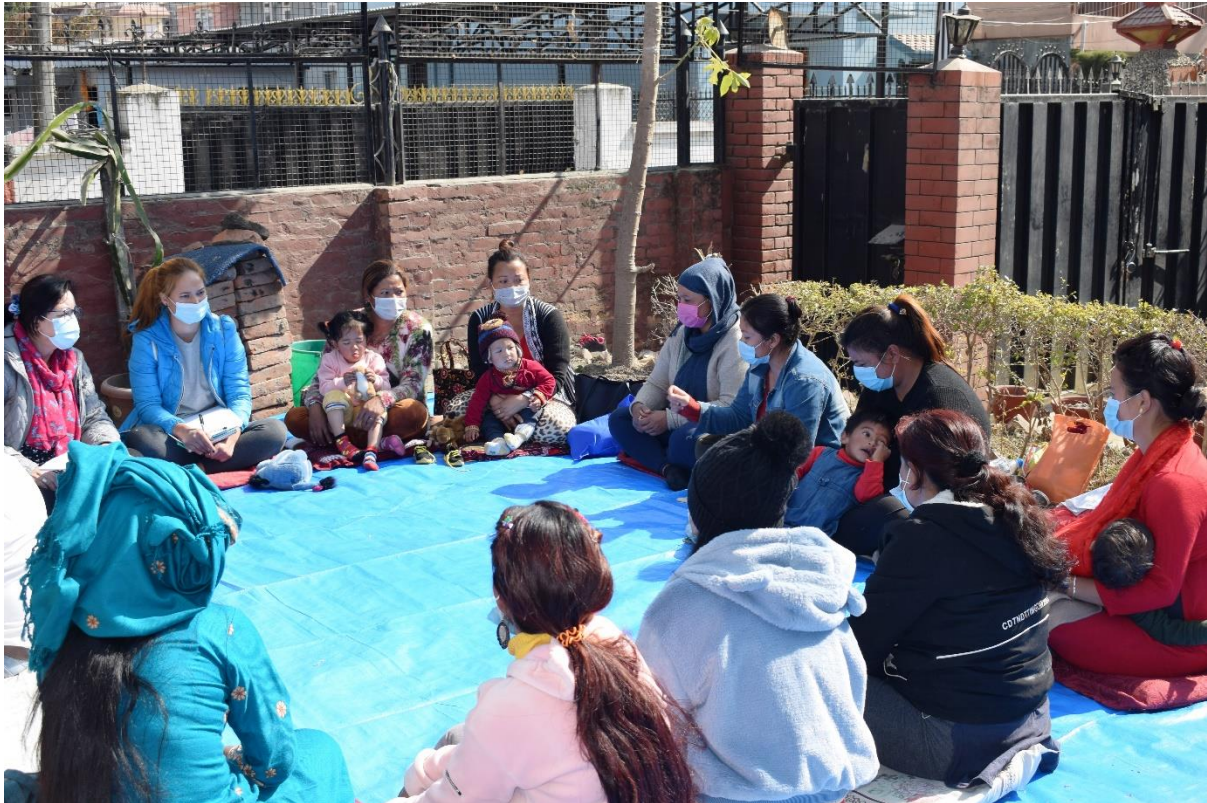
FGD with returnee women migrants at the Pourakhi Nepal Shelter Home