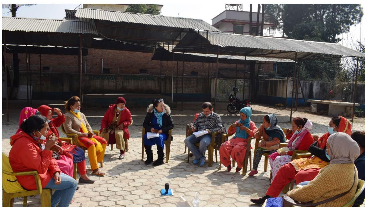
FGD at Dakshinkali Municipality, organised by Pourakhi