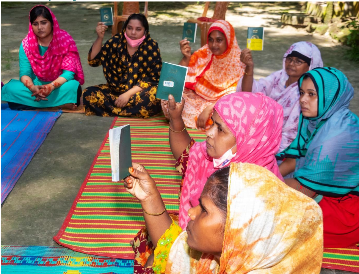
Photo during an FGD organised by Badabon Sangho

Despite social norms against women working outside the household (which are more pronounced in middle class and lower middle-class contexts), some of the women were strongly encouraged by their husbands and families to migrate for work largely out of economic necessity. For some, their low standing in their families and experience of domestic violence were also motivations. Some migrated without the consent of their husbands and hid their plans. Due to issues of control over remittances and other family rifts, they later got divorced. A few would have preferred not to work overseas but their families were insistent. One described this as ‘being sent abroad to work just so my family can relax with my earnings’.