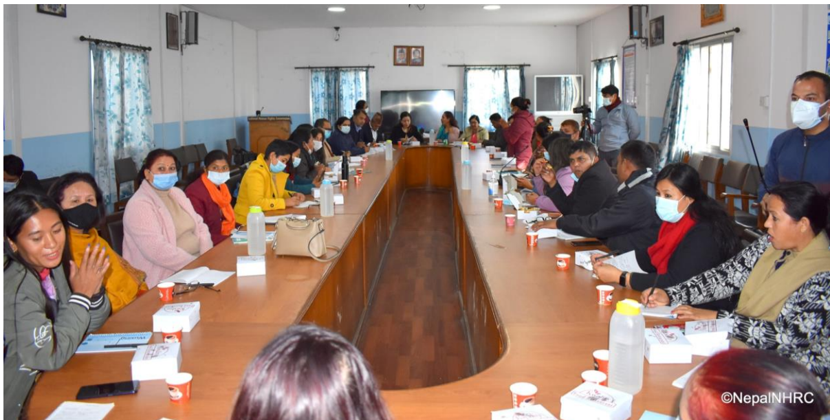
Interaction program on repatriation and reintegration of RMMWs

Returnees shared that they were told before going abroad that they will be sexually exploited. However, a significant number of them had positive experiences while working overseas. They were able to send back money which was used for their children's education and purchasing property. They felt that the state was not accounting for these the positive aspects of migration and the choice of women migrant workers.