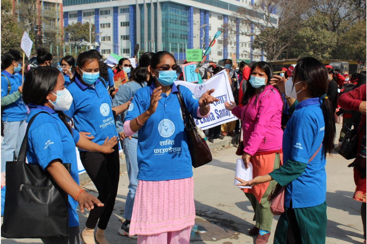
Shanti Foundation team dancing to celebrate International Women's Day at Tundikhel