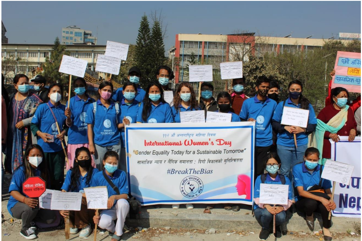
Shanti Foundation team group photo after the rally on the occasion of 112th International Women's Day

Happy International Women's Day. Here are two songs that have inspired us. We have used those on special days in performances.