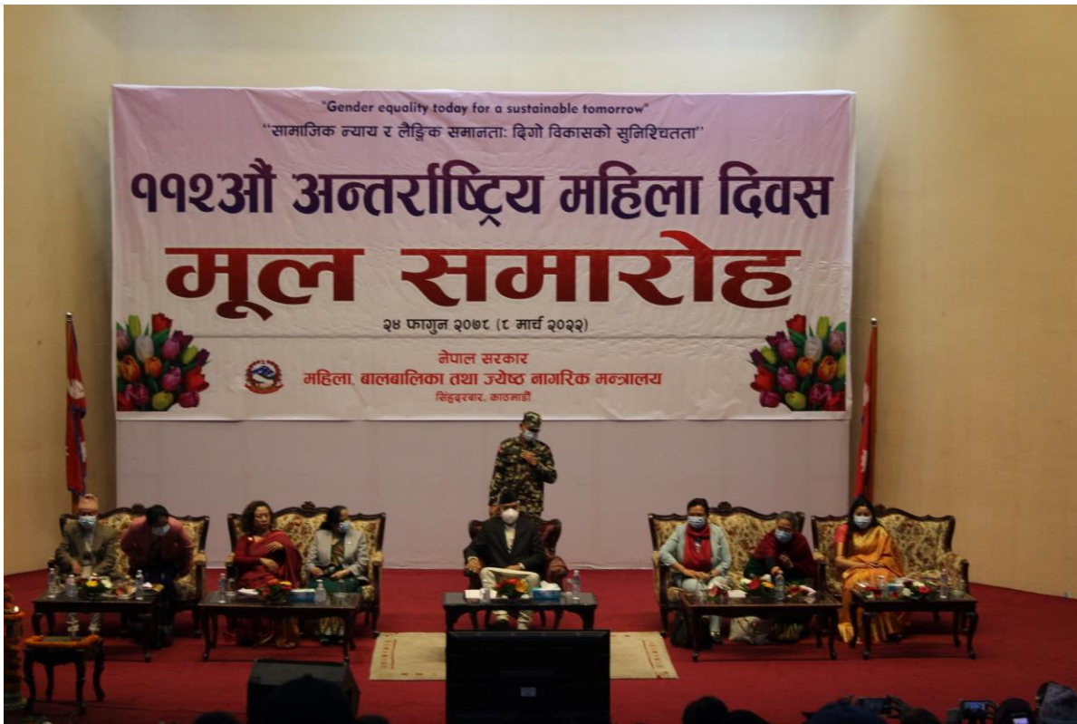
National Ceremony program at Rastriya Sabha Griha, Kathmandu in the chief guest of Prime Minister of Nepal Mr. Sher Bahadur Deuba on the occasion International Women's Day 2022.

We are also sharing the photos of our March 8 event this year.