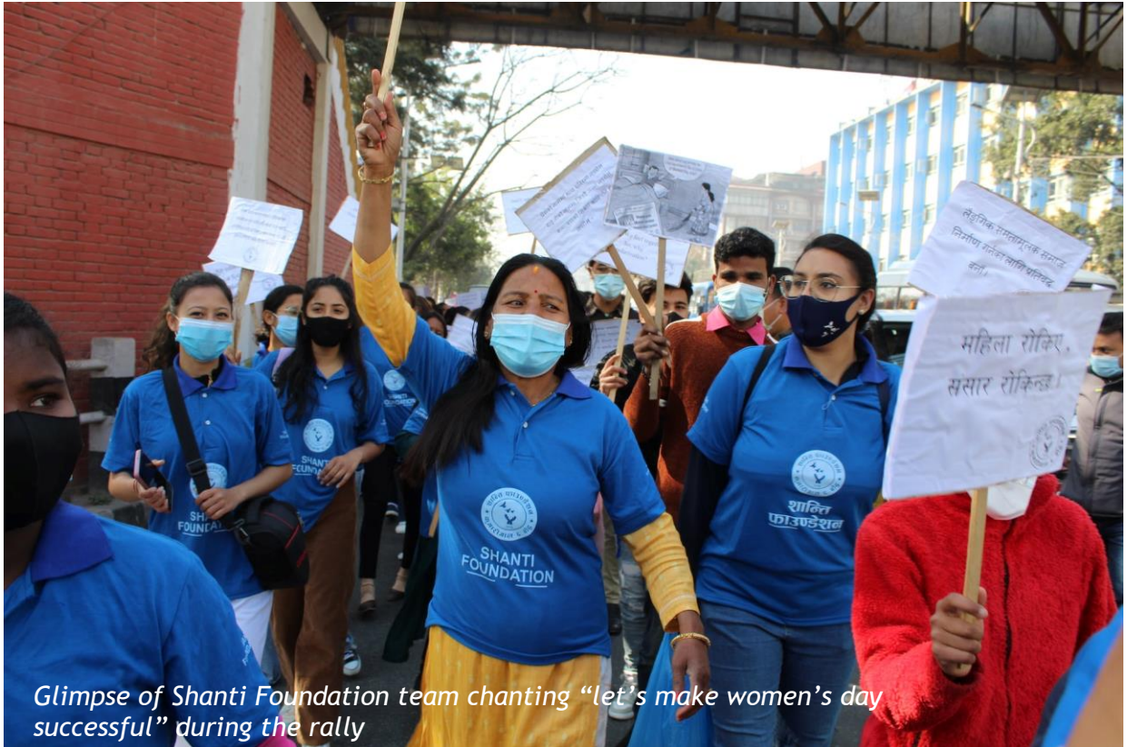
Glimpse of Shanti Foundation team chanting “let’s make women’s day successful” during the rally