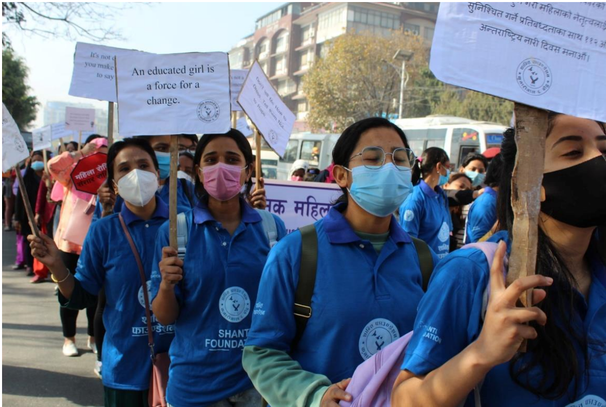
Glimpse of Shanti Foundation team holding different cards demanding for the rights of women during the rally