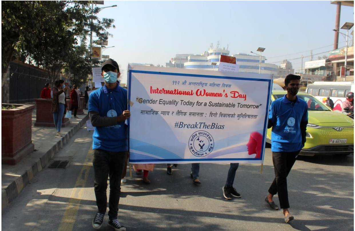
Rounding the Tundikhel area during the rally