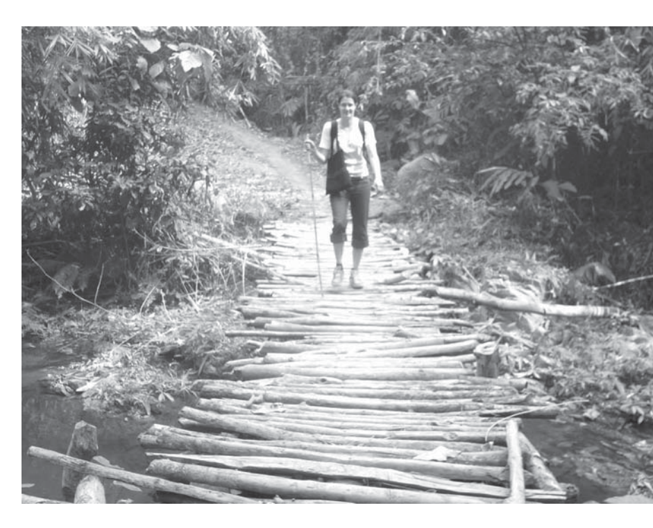
Approaching a hill tribe settlement

Holistic as the tours are in covering all three project dimensions, they likewise reflect the fact that one social problem goes hand in hand with others, and that trying to tackle one means having to deal with the others as well. Generating income for hill tribes in order to combat existing poverty, believed to be the major root cause for them being trafficked, is one agenda. Addressing other issues such as identity loss, weak social structures and drug addiction are also necessary. The eco tours in their design and implementation address the complex net of above mentioned issues and social ills. The tours are all-embracing, because they engage the whole community and do not only focus on the involvement of a preselected group of potential victims of trafficking.