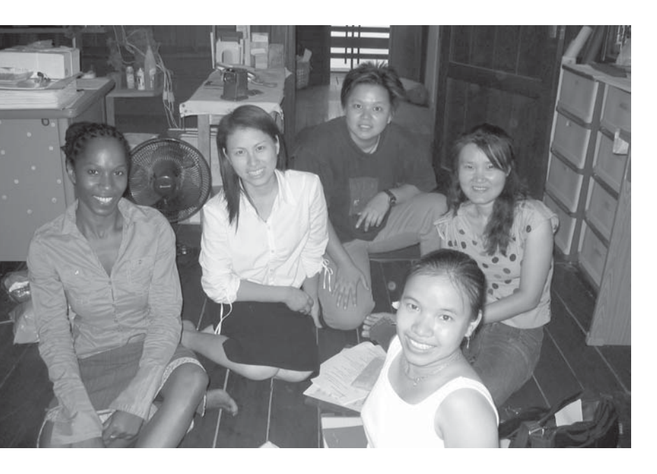
Staff taking a break

works, stating that when the group first started it worked in 14 target areas throughout the North, but today Gabfai works in only 5 areas. The group attributes this reduction to improved awareness of the issue in high-risk areas due in part to its prevention message.