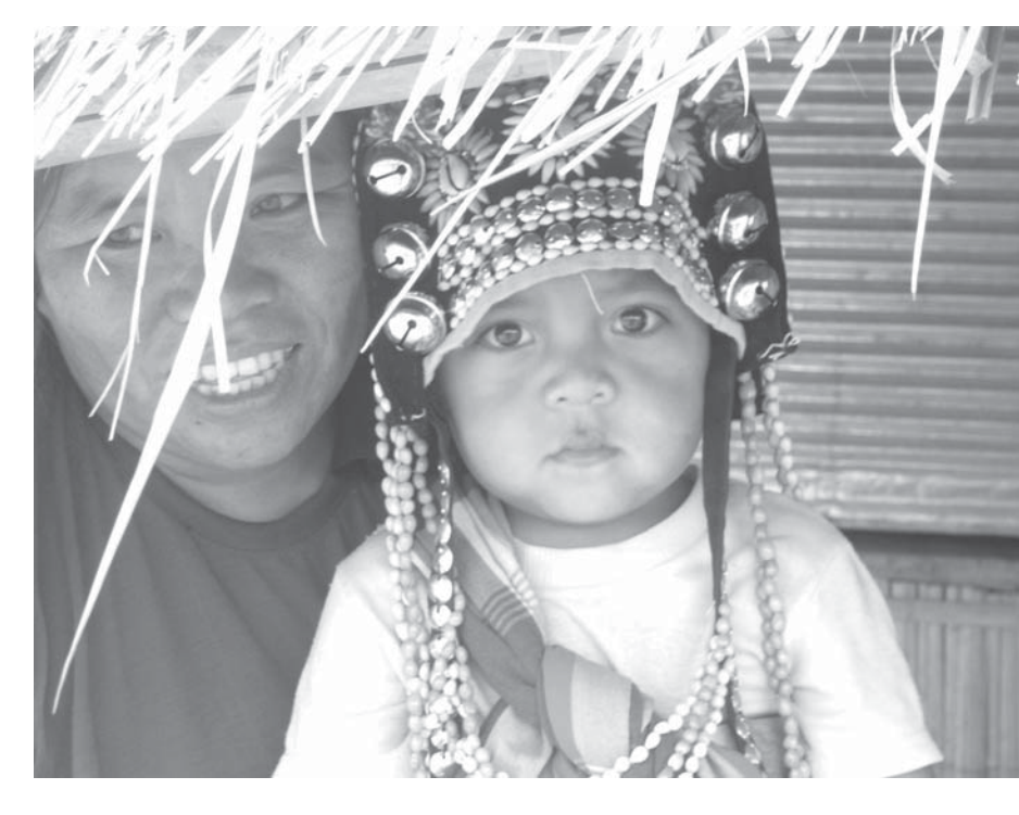
Akha mother with child

What started as one simple approach to prevent trafficking, within a wider project, turned out to be a multi-faceted complex undertaking. It provides the Akha and Lahu with a rare opportunity for self involvement to tackle their own issues. As part of a multi-pronged trafficking prevention project, MAG is one of three local implementing NGOs. The project consists of awareness raising strategies, coupled with capacity building efforts and income generation activities in the target villages. By strengthening the Akha and Lahu communities economically and socio-politically the project aims to combat the phenomenon of human