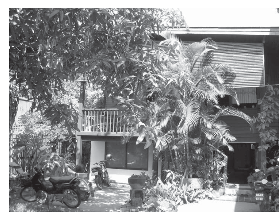
Gabfai office, Chiang Mai

The English translation of Gabfai is 'matchstick.' The group's motto is 'A