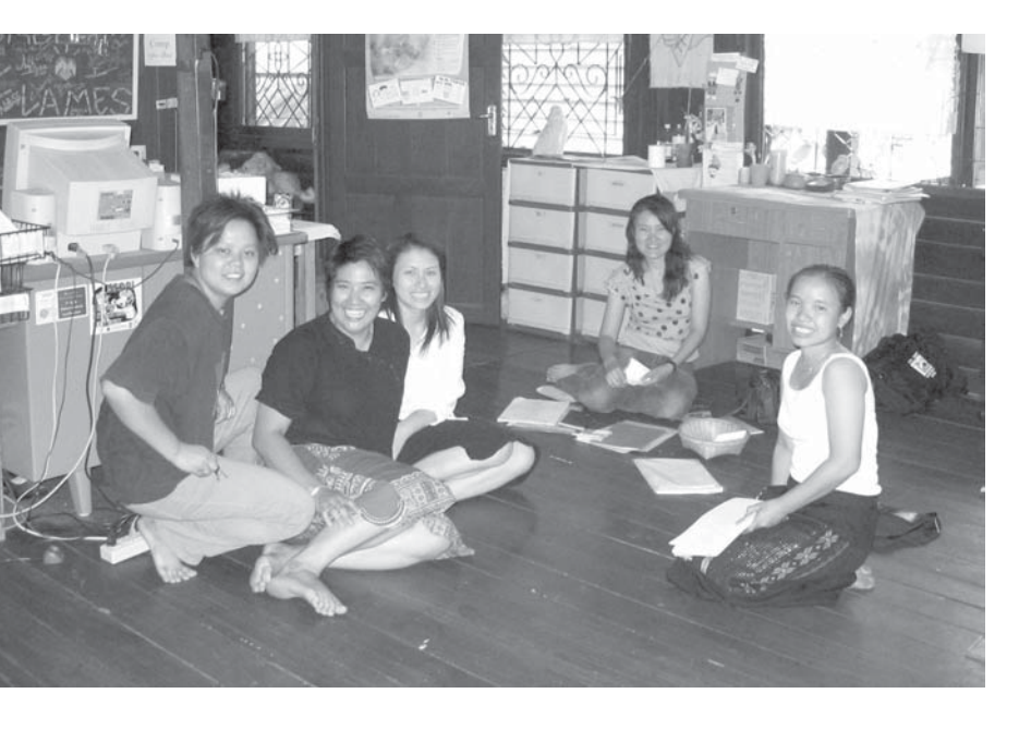
Gabfai staff meeting

Gabfai was born out of its director's desire to work locally within Thailand to address the issue of human trafficking. He worked with a theater group in Bangkok which focused mainly on the issue of 'child prostitution' and targeted a mainly western audience (the group performed in the United Kingdom and Germany) and Thai nationals living in the west. When the Bangkok group split up he made the decision to start a group in Northern Thailand to raise awareness of human trafficking mainly because there was a need for education on the issue of trafficking. The North of Thailand was perceived as a 'sending region' for trafficked persons by the rest of the country underscoring the need for intervention.