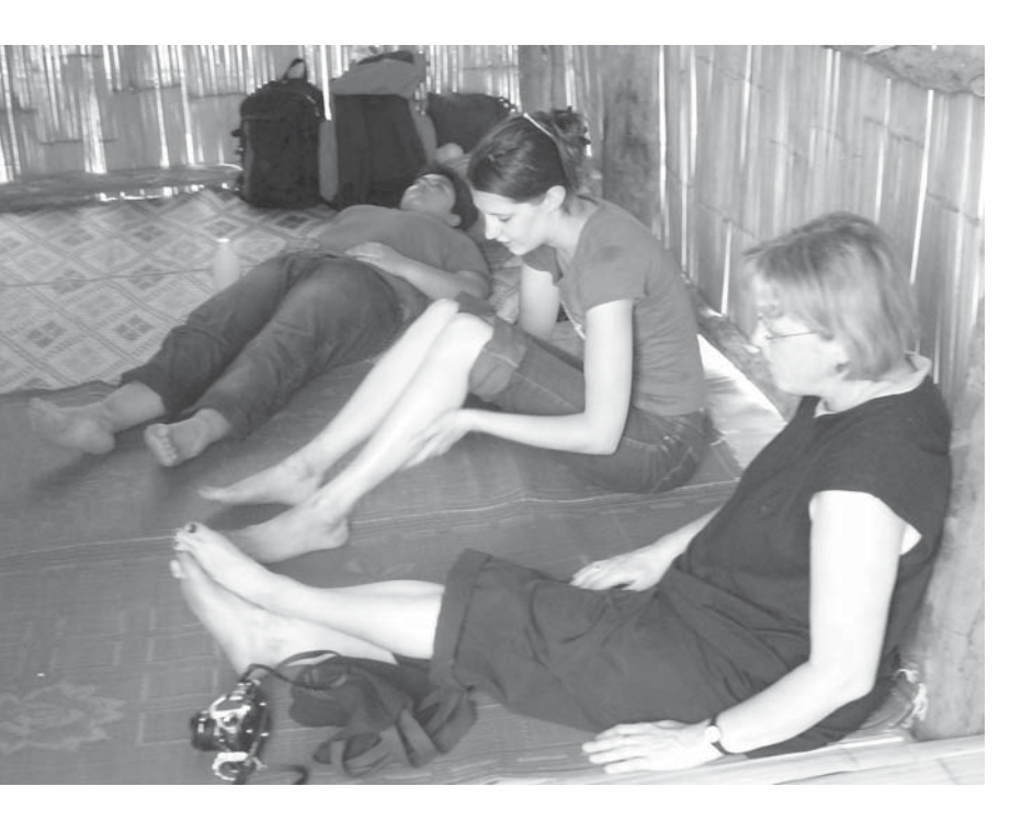
Exhausted eco tourists

the beginning of the twentieth century they started to migrate slowly into Northern Thailand from Burma - a process that continues to this day.