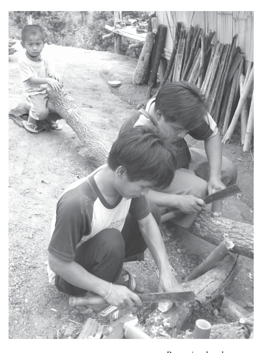
Preparing bamboo cups

Although primarily subsistence farmers, growing rice and corn for