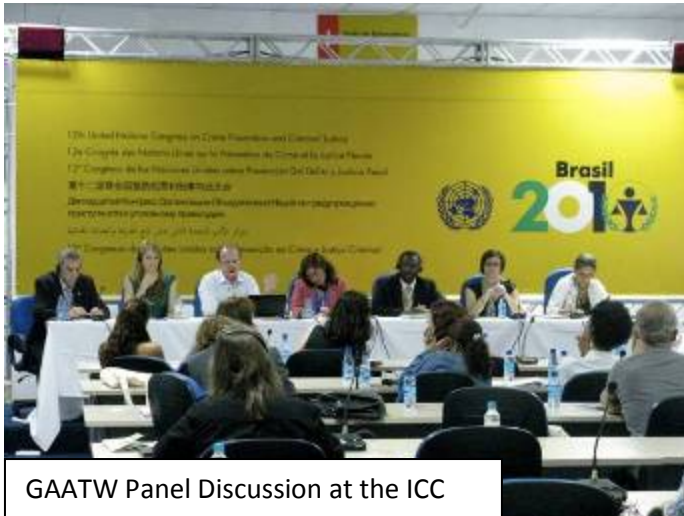
GAATW Panel Discussion at the ICC

The theme for the ICC was 'Comprehensive strategies for global challenges: crime prevention and criminal justice systems and their development in a changing world'. Two specific ICC topics of interest to GAATW were: Criminal justice responses to the smuggling of migrants and trafficking in persons, and links to transnational organized crime and Crime prevention and criminal justice responses to violence against migrants, migrant workers and their families .