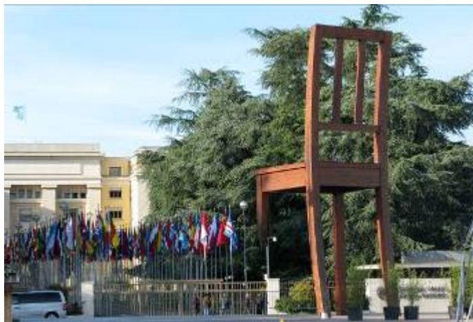
Palais des Nations, housing the UN in Geneva.

Relevant discussions included a panel on the impact of the global economic and financial crises on the universal realization and effective enjoyment of human rights and a full day meeting on the rights of the child. Special Procedures presenting their reports were the Special Rapporteur (SR) on adequate housing as a component of the right to an adequate standard of living; the SR on terrorism; the SR on torture; the SR on the situation of human rights defenders; the independent expert on minority issues; and working groups on enforced disappearances and arbitrary detentions.