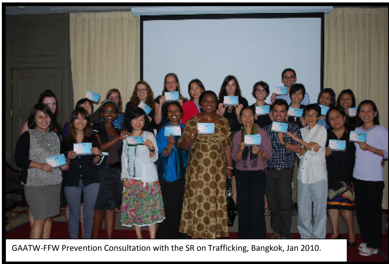
GAATW-FFW Prevention Consultation with the SR on Trafficking, Bangkok, Jan 2010.