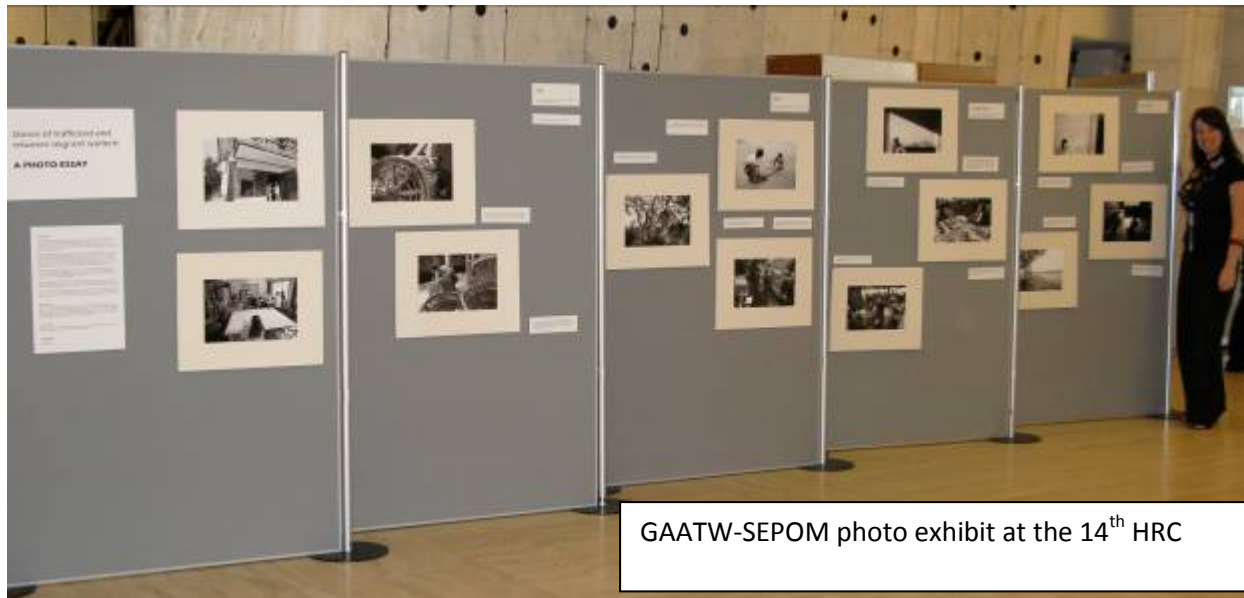
GAATW-SEPOM photo exhibit at the 14 th HRC