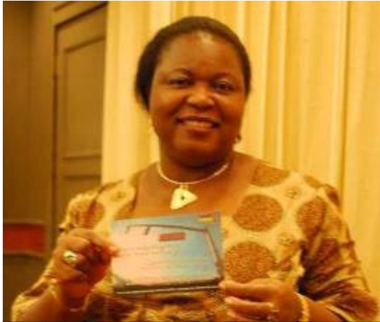
Special Rapporteur on Trafficking in persons displays her support for the GAATW Review Mechanism campaign.