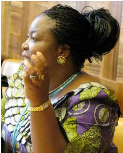
SR on Trafficking speaks at the GAATW side event